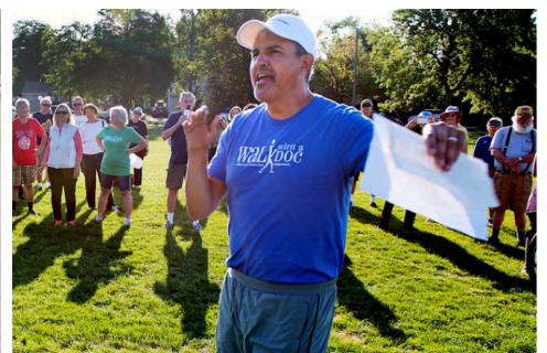
We are a proud part of the international Walk with a Doc program: Chapter # 32402